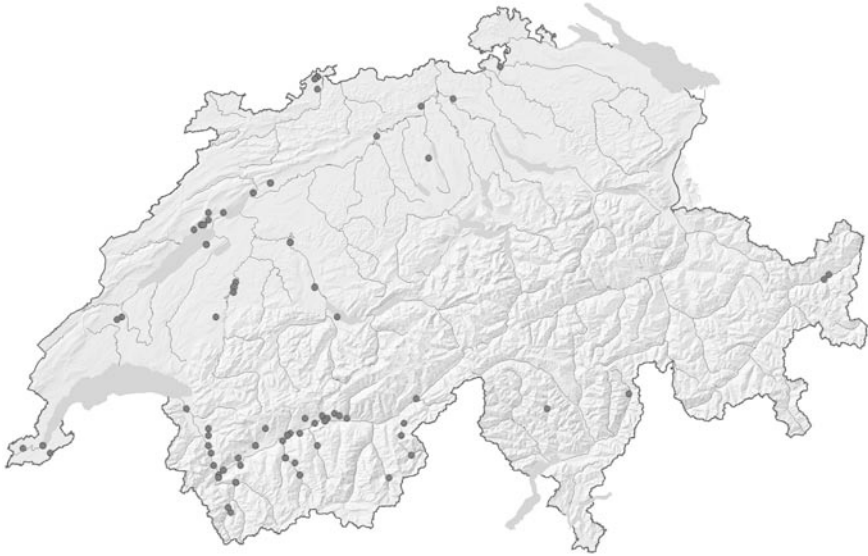
Fig. 2. Finding sites of Simo variegatus (Boheman, 1843) in Switzerland.

4. Antennal articles ( variegatus last articles before club transverse, stronger than in hirticornis ).