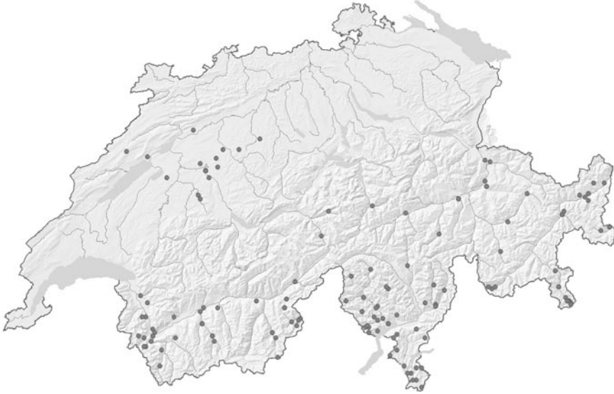
Fig. 1. Finding sites of Simo hirticornis (Herbst, 1795) in Switzerland.

den, Neuchâtel, Schaffhausen, Solothurn, Ticino, Vaud, Valais), S. hirticornis in 8 cantons (Bern, Freiburg, Graubünden, Neuchâtel, St. Gallen, Ticino, Vaud, Valais).