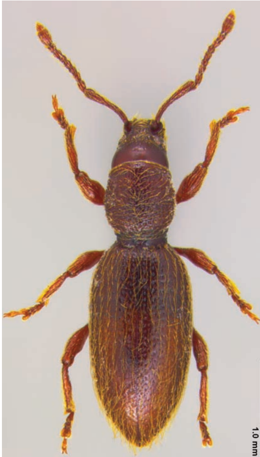
Fig. 2. Habitus of Stomodes letzneri Reitter, 1889, Crete, Chania, S-Alikambos, Krapis.

It was Wagner (1912) who made the last revision of Stomodes . Presently the genus includes 13 taxa (11 species and two subspecies) in the Palaearctic realm