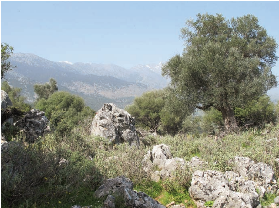
Fig. 1. Habitat of Stomodes letzneri Reitter, 1889 within an olive grove on Crete, Krapis, 7 th April 2012.

On a joint entomological excursion together with Lepidopterologists, Crete Island was visited from 5th to 14th April 2012. The focus was set on the western province Chania, and there mainly on an area along a north-south axis at the foothills of the Lefka Ori massif. With different collection techniques (hand catches on plants, beating tray, sweeping and sifting), more than 88 taxa of Curculionoidea were collected, among them three female specimens of a member of the genus Stomodes Schoenherr, 1826 with the indications given in the following: