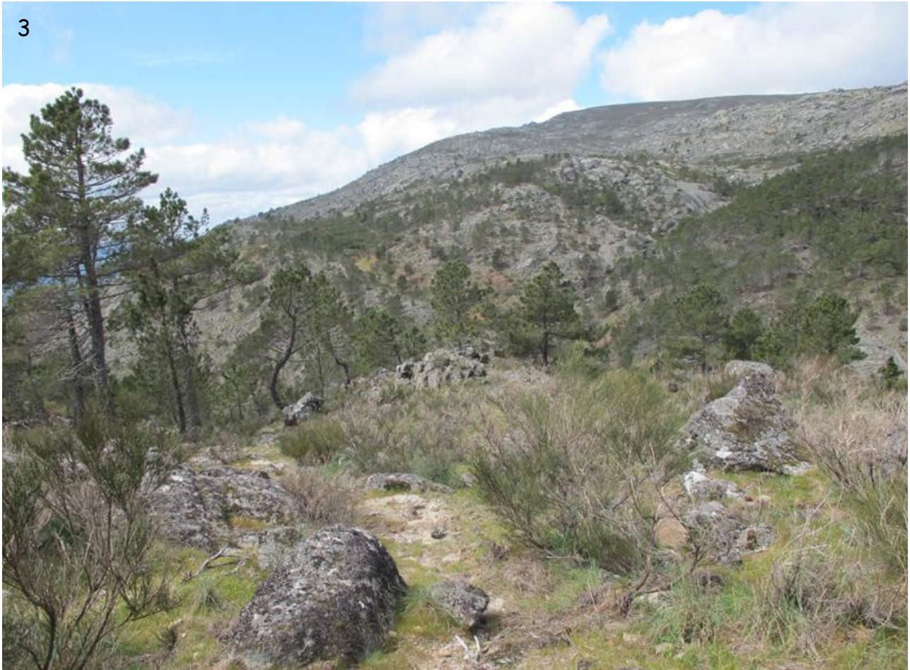
Fig. 3.- Habitat of Orthochaetes estrelanus sp. n. Type locality at Vale das Cortes, 22.4.2014.