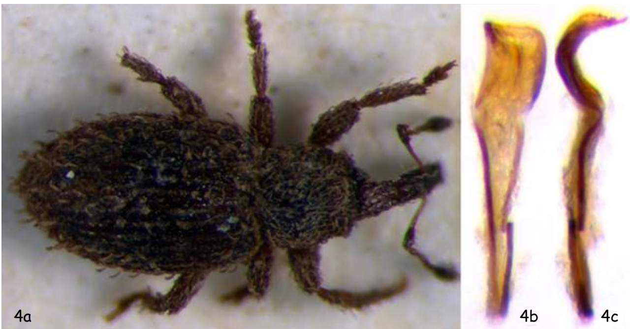
Fig. 4.- Orthochaetes nevadensis González, 1967. a.- Holotype from Lanjarón, Sierra Nevada, in Manuel González's collection, conserved at the MNCN. b.- Penis, dorsal view. c.- Penis, lateral view.