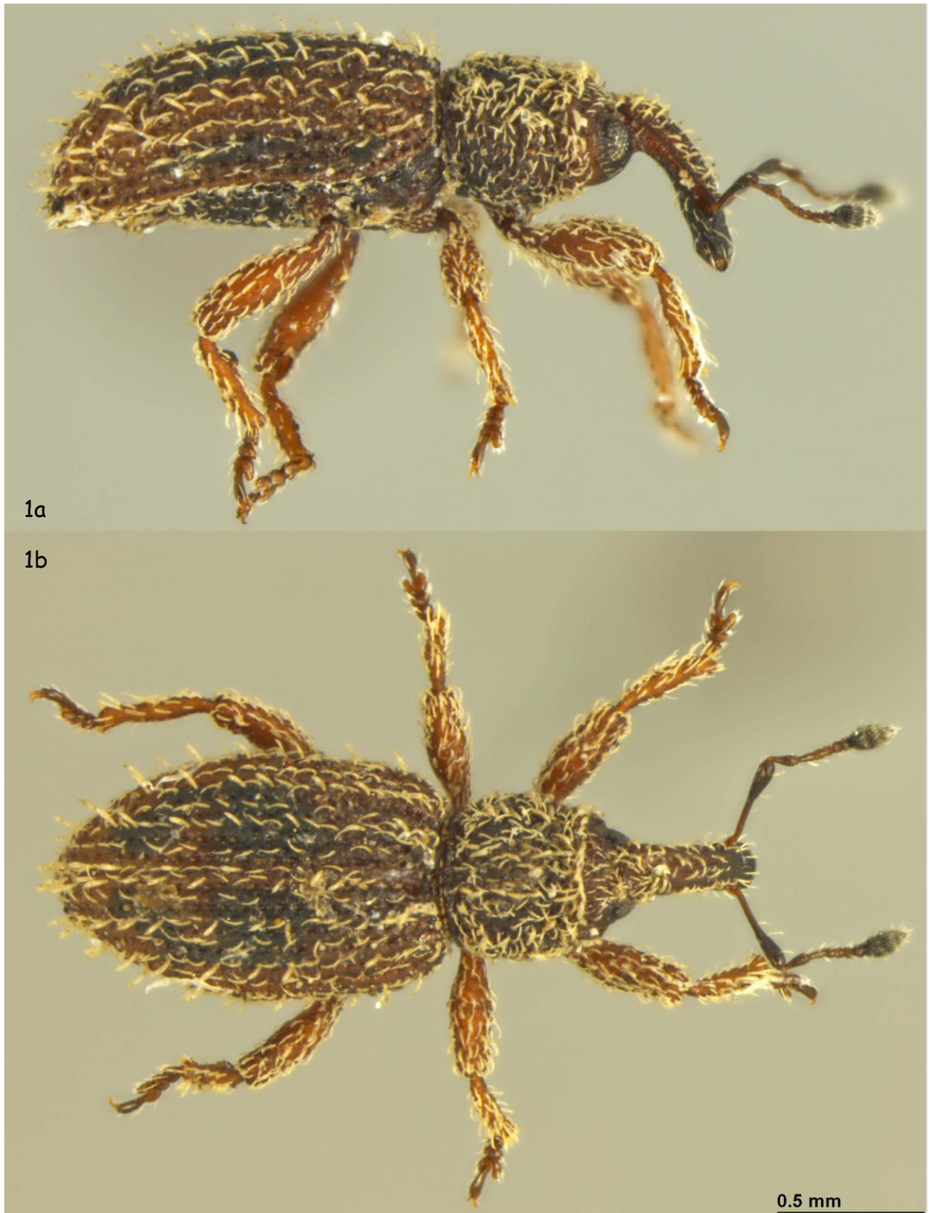
Fig. 1. - Habitus of Orthochaetes estrelanus sp. n. a. - Lateral view. b. - Dorsal view.